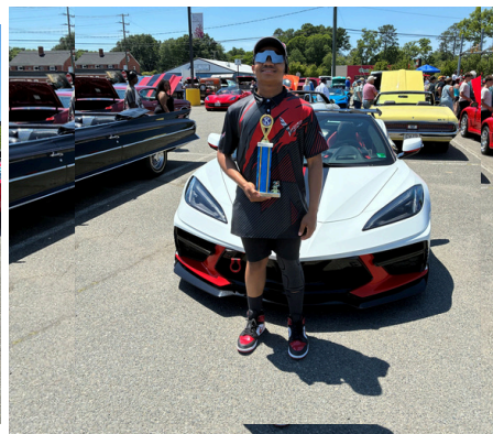
Class E '96 and Newer Stock Ivory Brown 2023 Chevrolet Corvette