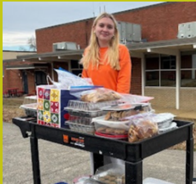
Valentine's Cards for assisted living