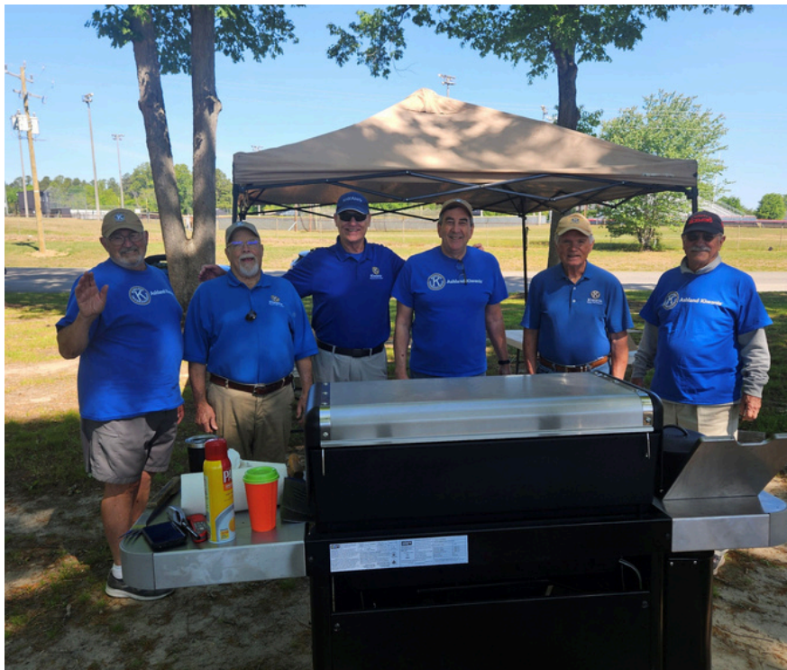
Liberty Lunch Crew

The teamwork and camaraderie from Train Day carried over to make this event fun for all of us. We had a beautiful shady spot with great weather. Special thanks to our volunteers.