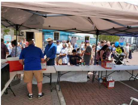
As usual, the lunch lines all came at once