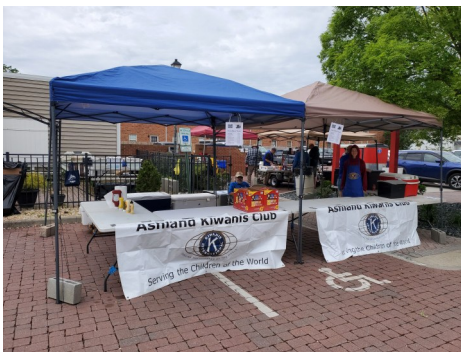
We are ready for the lunch lines