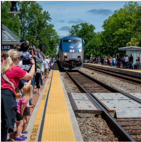
Saturday April 26th