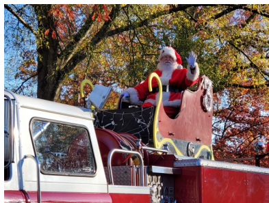
Here's comes Santa!!