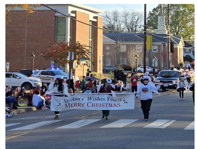
St Ann's Message