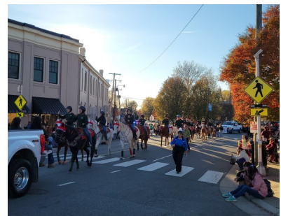
And we had horses