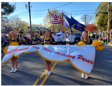
The Parade Banner carried by RMC Cheerleaders on a windy day.